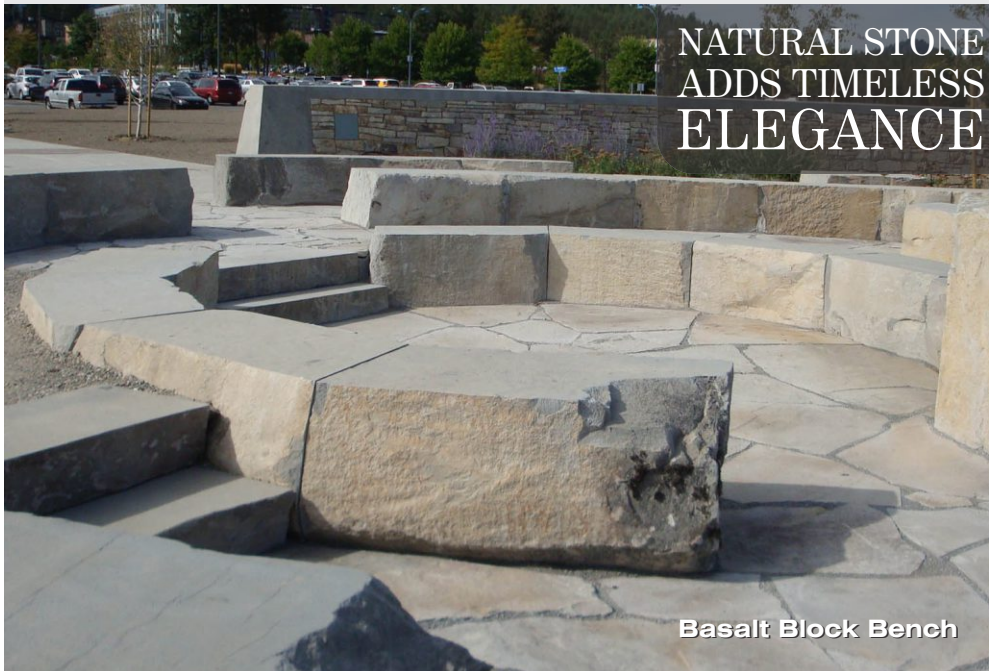
Basalt Block Bench

⬇ Image shown below has sawn ends to allow for tight fit.